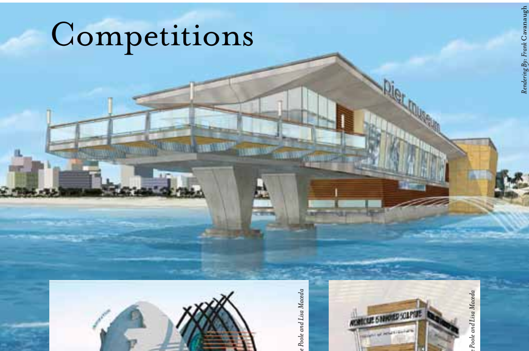
Rendering By: Frank Cavanaugh