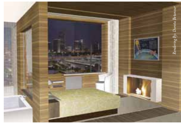
Rendering By: Dorota Betancur