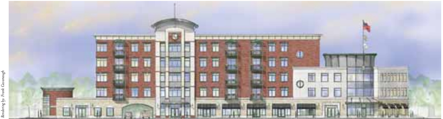
Rendering by: Frank Caranough

Many suburban town centers having historical roots and good transportation access are currently experiencing a new wave of development. The market for medium density, mixed-use projects is on the rise. We developed this design for a mixed-use project on an entire block in Berwyn's Historic Depot district. The design includes 16,000 SF of residential condominiums. An 88-car below-grade parking deck and a branch bank are also included.