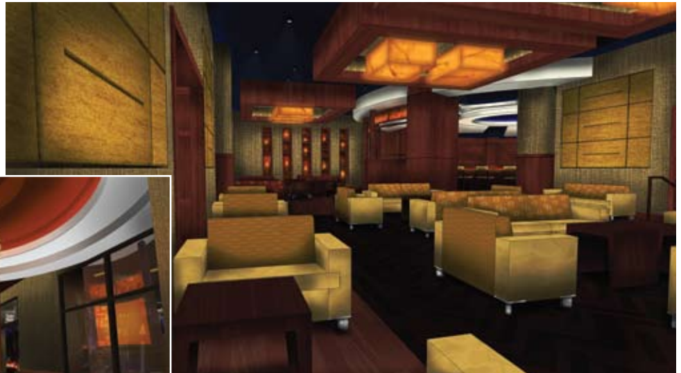
Renderings By: Javier Burciago