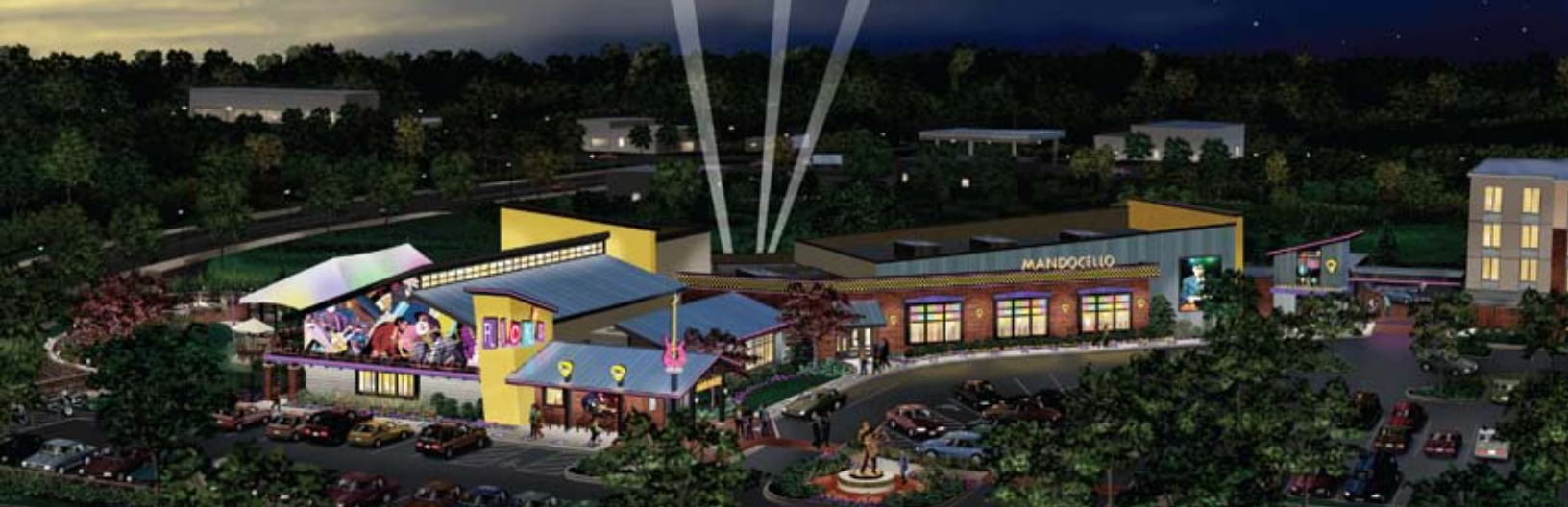
Rendering and Logo By: Frank Cavanaugh