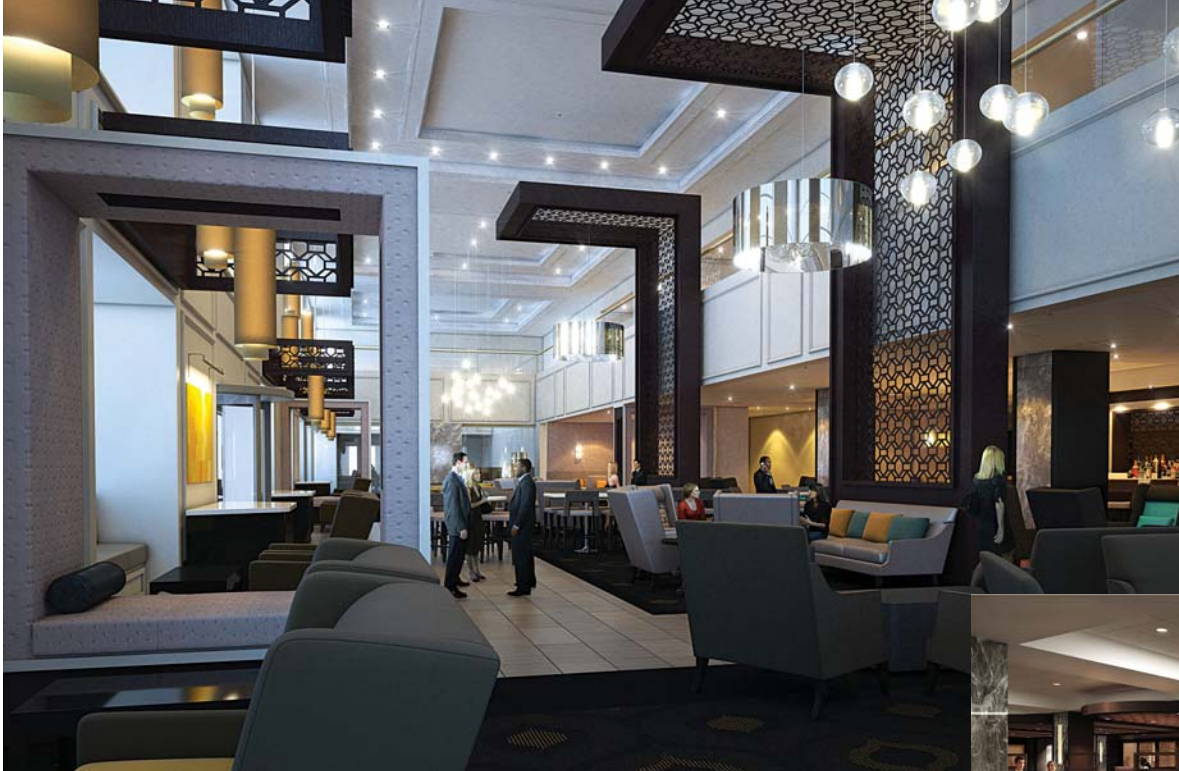
Rendering by RM Design Studio