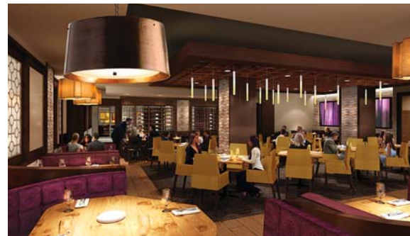
Rendering by Image Fiction