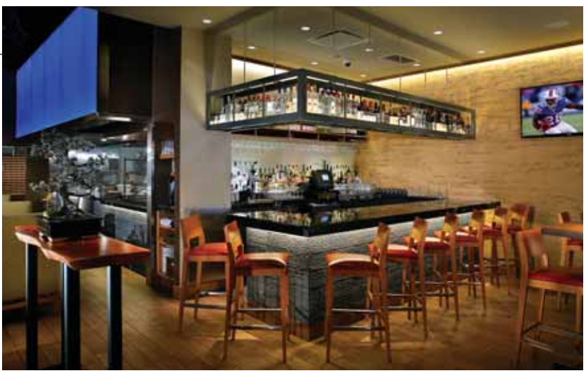
ography by Antho

Roka Akor at Old Orchard Mall is the latest restaurant by JNK Concepts, who have developed Roka Akor and Bombay Spice in Scottsdale, AZ and Chicago, IL. This 2,500 SF mall end-cap location captures the essence of Roka's signature sushi and steak dining: an open-flame Japanese-style Robata grill on display, an upscale casual atmosphere, sidewalk patio dining and lounge experience. The contractor was Englewood Construction.