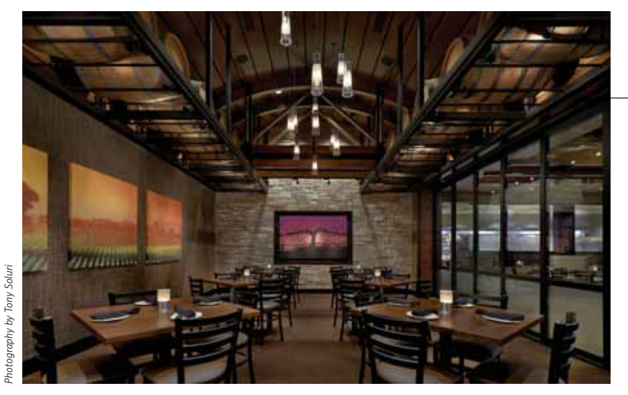
Projects scheduled to open in 2014 include Richmond, VA and Springfield, IL.