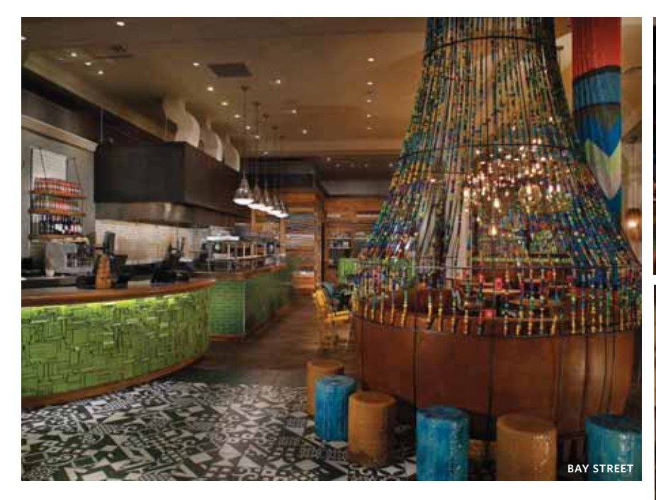
Nando's locations opening in 2014: Towson, MD; Ashburn, VA and Springfield, VA.

The Bay Street location is the new Canadian flagship location for Nando's Flame-Grilled Chicken. Located in the historic McLaughlin building, the design preserves the building's heritage while enhancing it with the vibrant, whimsical design Nando's is known for. Also pictured is Nando's Peri-Peri located in the Arundel Mills Mall. The contractor for Arundel Mills was Herman Stewart Construction and the contractor for Bay Street was Horne Construction.