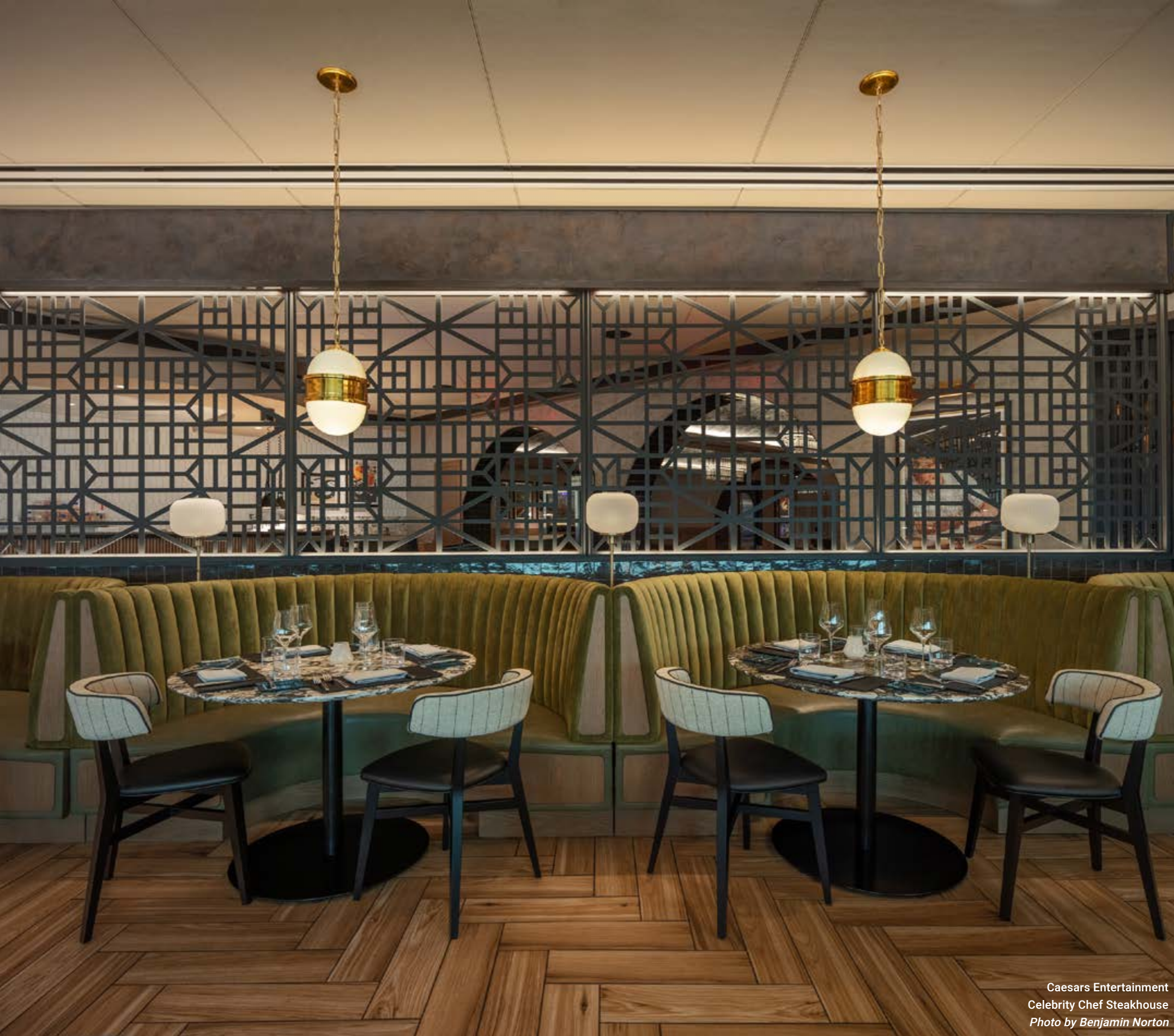
Caesars Entertainment Celebrity Chef Steakhouse

This year marks a big moment in Aria Group history! We are celebrating our 35th anniversary, and with it the incredible projects and people that have allowed us to last. We're welcoming new faces, building new relationships with clients, and pushing our capabilities to new heights. More than three decades in this industry is no easy feat, and we are so grateful for the trust and opportunities our partners have given us over the years. We have big plans on the horizon for 2024, and we can't wait to take you along that journey with us.