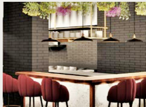
LUCKY CAT Miami, FL