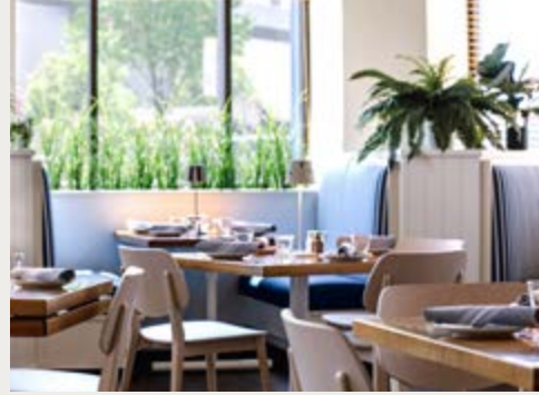
SALTWATER Rosemont, IL