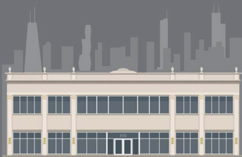
Aria Group 830 North Blvd Oak Park, IL 60301