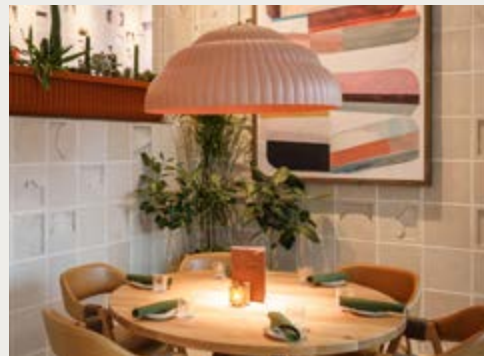
VERDAD Austin, TX